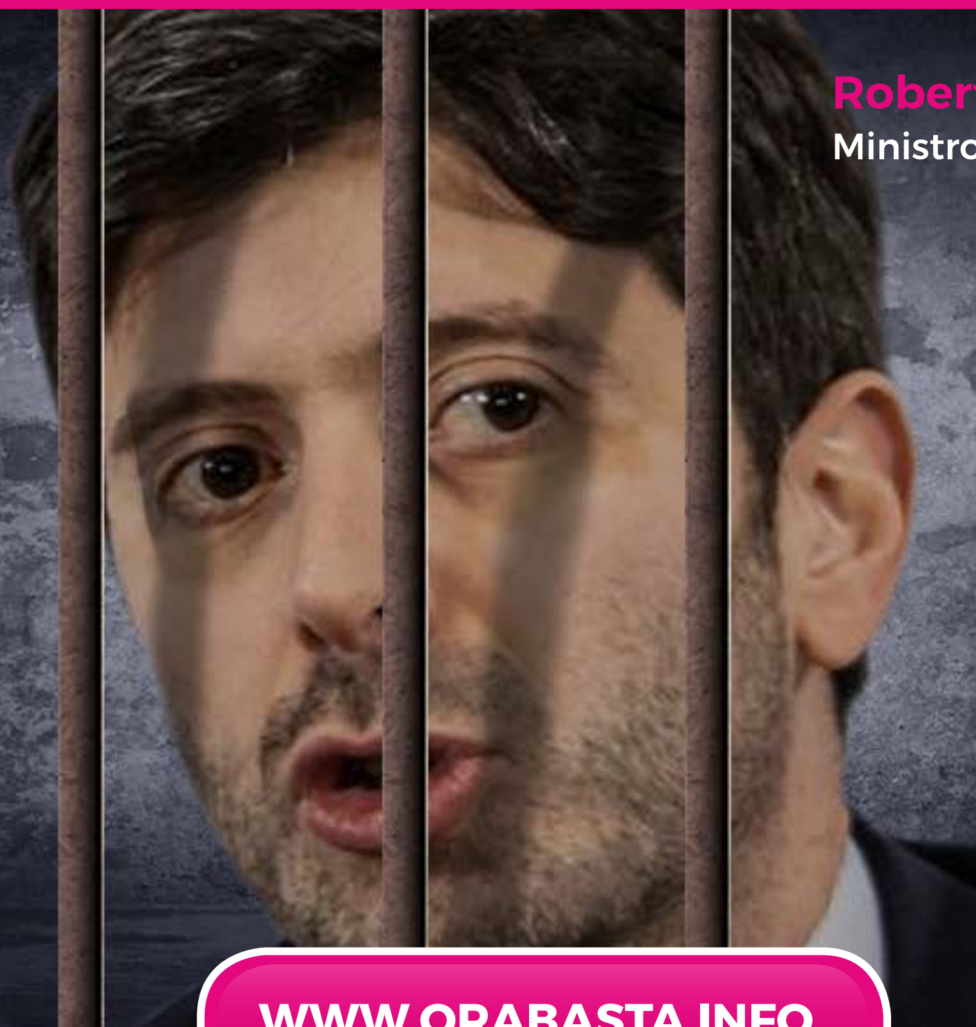
Roberto Speranza Ministro della salute